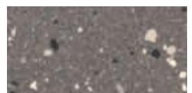
MW Terrazzo light gray

Composition 40% Clay, 40% Feldspat, ~20% Sand and quartz, ~15% Kaolin and carbonate