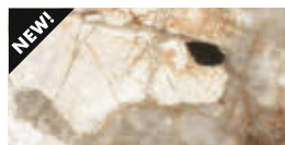
TU Nature Tundra