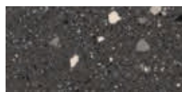
QW Terrazzo black