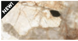
TU/BU/NU Nature Tundra