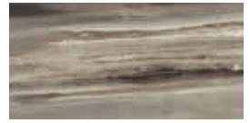
MG/BT/NT Tropical Grey