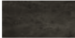
CN Aged Bronze